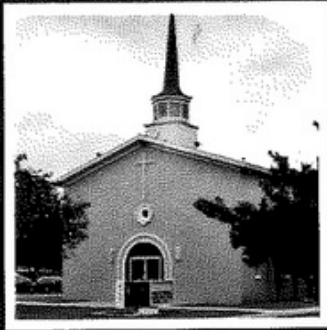
St. John Presbyterian Church 4120 N. MacDill Ave., Tampa, FL 33607

Please join our celebration Sunday, April 23rd, 2017 11:00 a.m. Worship Service Reception to follow.